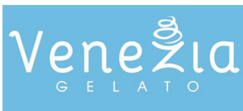
Gelato Ice Cream